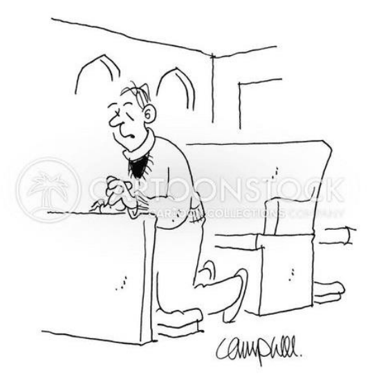
"Amen. Please help me up."