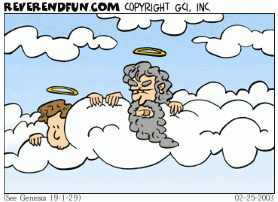
SOMETIMES I MISS THE OLD TESTAMENT DAYS WHEN WE COULD SMITE THEM FOR THAT KIND OF BEHAVIOR

Entry remains free to enter for worship, prayer, and to light a candle and free passes are available for parishioners in the diocese. Information about the Parish Pass and how to apply for it is available from the Wells passes section of the Wells Cathedral website. You will note that the application form for a Parish Pass does require a signature from a churchwarden or incumbent.